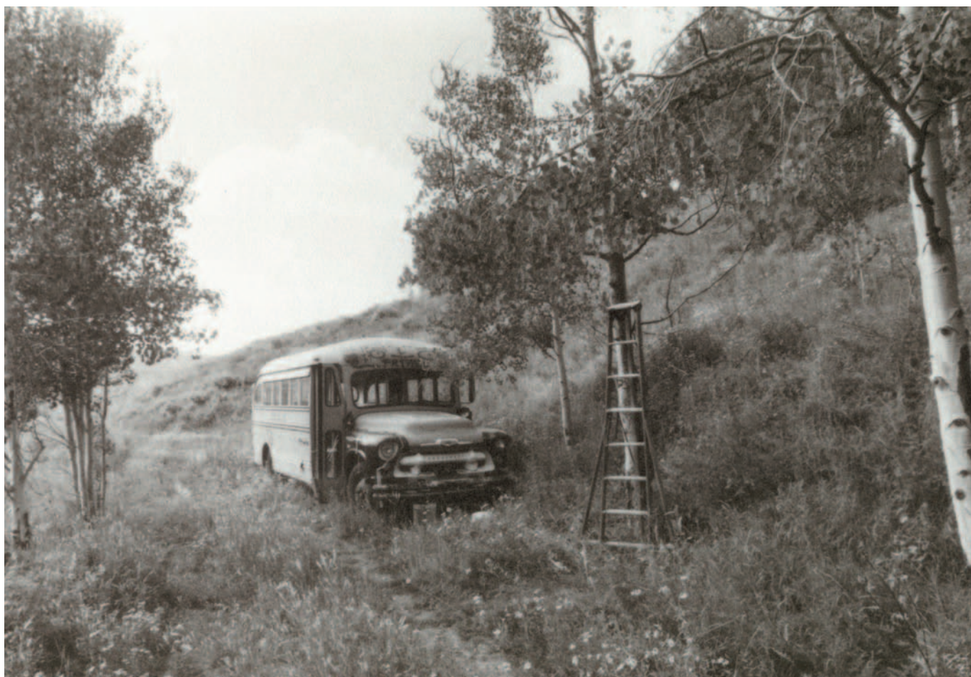
School Bus, Red Cliff, CO 1994