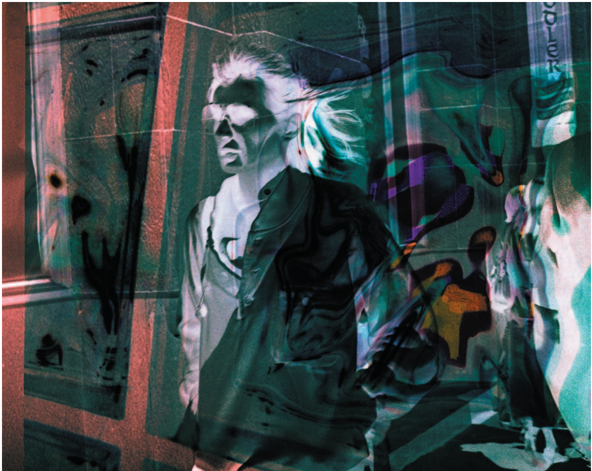
San Francisco Man, SF, CA 1987