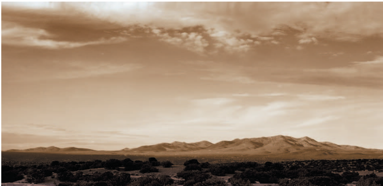
Sunrise in Santa Fe, NM, 2001