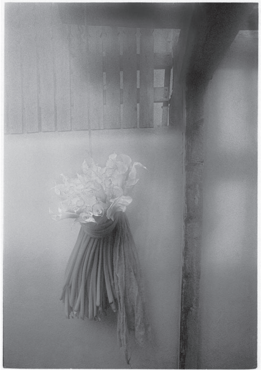
Misty Calla Lillies, Santa Fe, NM

A printers proof print will be made and billed at first print prices when an edition of platinum/ palladium prints is contracted. All subsequent prints will match the OK'd printer's proof (PP). The PP print remains the property of the printer. Subsequent prints will be billed at no more than 2-5 print pricing. The pricing of an edition will be agreed upon prior to printing and pricing will be guaranteed for a period of 1 years. You should use the attached price schedule as a guide in calculating a starting point for edition pricing. Orders of $3000.00 will begin to see discounting. Papers used include but are not limited to: Simili Japon, Platine and Beinfang. The Beinfang paper is an extremely thin paper and does have a higher price for printing due to extra care it requires.