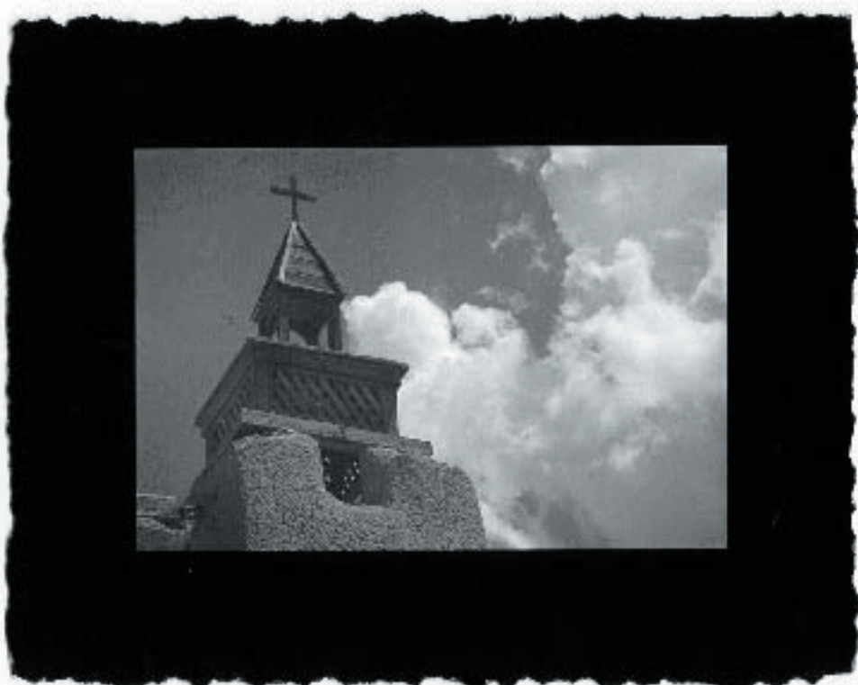
Las Trampas Church, Las Trampas, NM 1994

The film type will give us sharpness, grain, and tonal scale. The paper will also effect sharpness and grain, along with the luminous quality of the print. The coating mixture and developer used will have profound effects on print color, and grain. An often over looked aspect of platinotypes is edge treatment. The edge treatment allows the print maker to give the print many different qualities, ranging from clean edges with the print floating on an oversized paper, to expressive brush strokes. These may even be carried all the way out to the edge of the paper, giving the print all black borders. These edge treatments allow for the print to have the clean look of a silver gelatin print or the distinctive handmade quality . Highly discouraged, and not offered, is the use of over sprays, dry mounting, waxing, and other presentation techniques that limit the life of an otherwise extremely long lasting print.